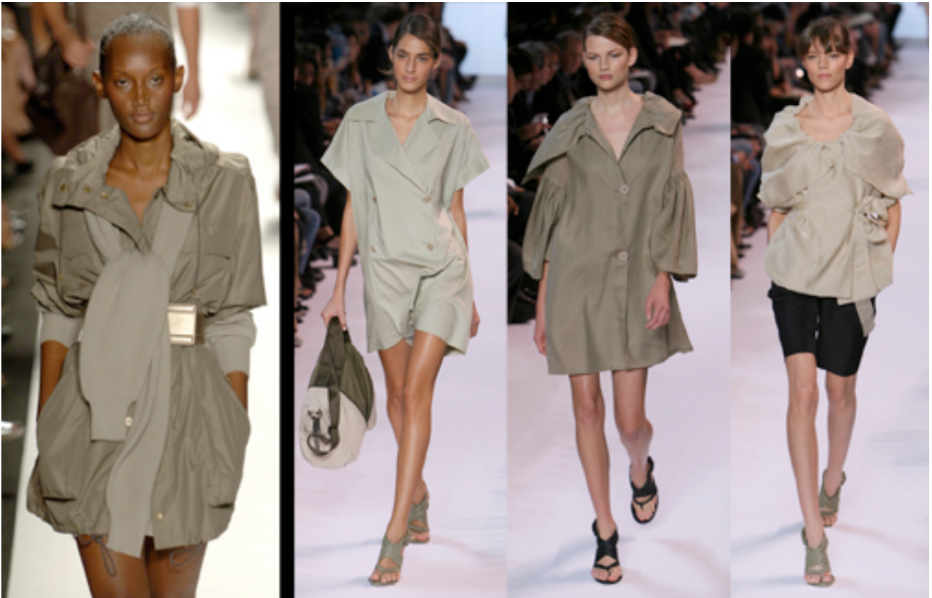
Un-drab fab at Michael Kors (L) and Stella McCartney (R trio)

The staple fabric formerly known as “conservative and safe” reappeared this season with reinvention worthy of Madonna’s last tour. Could this really be khaki? From Sonia Rykiel's metal-tinged fabric to Stella McCartney's light bubbly coatsdresses – the safari mainstay is packed and ready for a spring adventure. To throw us off the usual trail, Michael Kors used a khaki color in a body skimming knit and threw sumptuous sandy-toned sweaters on shoulders for an easy to emulate casual luxury. Kick your khaki up another notch with metallic accessories treated as neutrals. Enjoy.